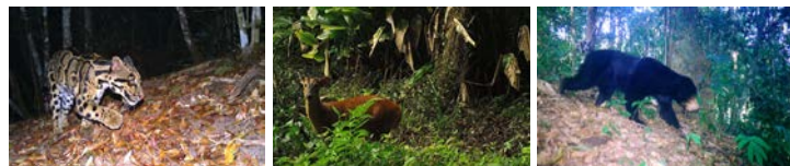
ເລືອນລາວ Clouded Leopard ( Neofelis nebulosa ) ມ້າງາມ Red Muntjac ( Muntiacus muntjak ) ເສຍະຍາ Sun Bear ( Helarctos malayanus )

Altogether NEPL NP hosts 19 carnivore species, roughly 50 species of mammals, and 299 species of birds, including, Blyth's kingfisher, Spot-breasted Laughingthrush, Rufous - Necked Hornbill, Red-Collared Woodpecker, Indochinese Green Magpie.